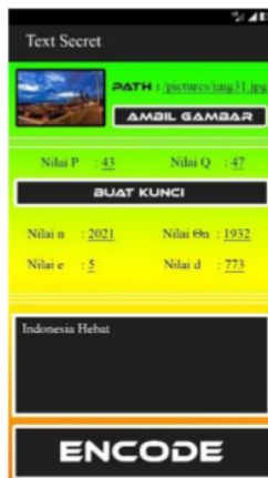
Figure 2. Layout Menu Encode

In the main menu layout of the application, the user can choose a menu on the application for further processing by the system. There are 2 main menus, namely the encode menu which will encrypt the message which is then inserted into the image image, and the decode menu which will extract the message from the image that produces the ciphertext and then decrypt it using the RSA algorithm that produces a plaintext in the form of the original message. The following encoding menu layout can be seen in Figure 2 :