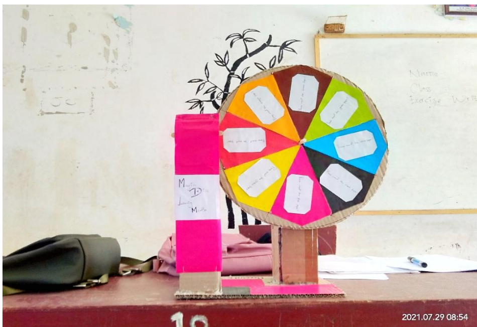
Figure 2.1 Magic Disc Learning Media

Here the example of Magic Disc Learning Media